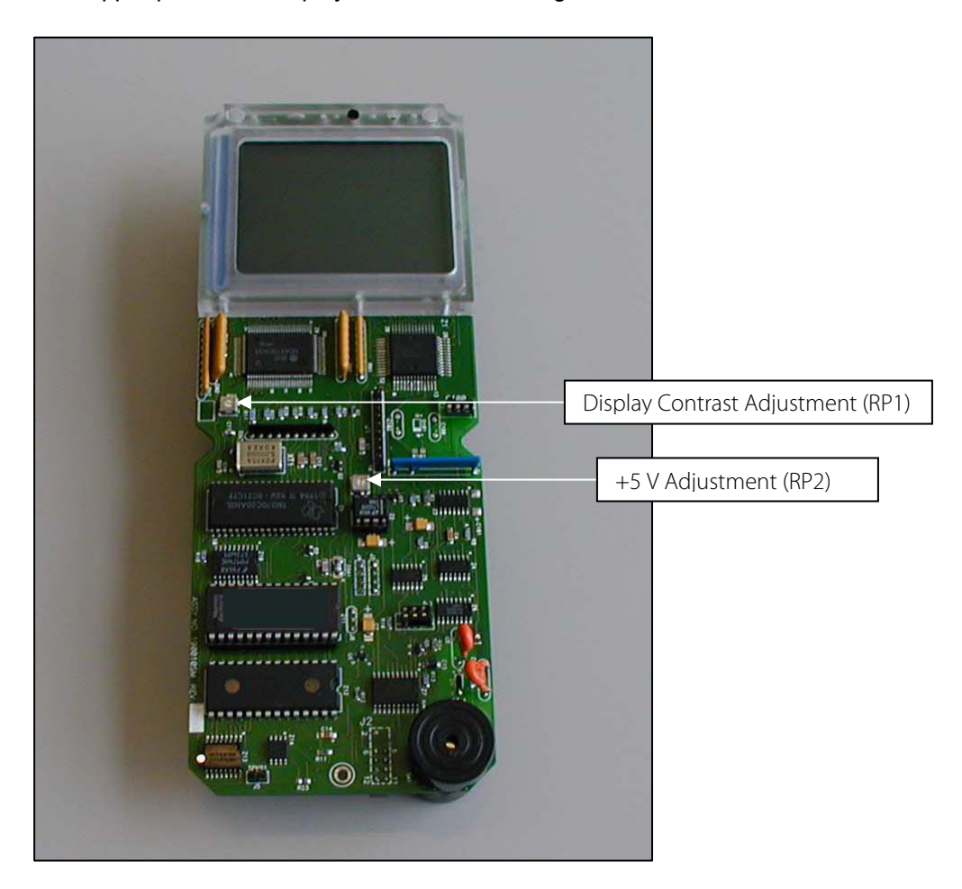
Figure 1-1.RP1 Location

The 190I display is designed for optimum viewing at approximately 60° from the plane of the display and directed toward the bottom of the instrument. The Display Contrast Adjustment (RP1) is factory set for optimum viewing and it is not recommended that it be further adjusted. However, if the display contrast requires adjustment, turn RP1 to vary the angle of maximum contrast of the 16-character display. The contrast for the upper part of the display is fixed. Refer to Figure 1-1 for RP1 location.